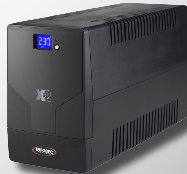
X2 LCD Touch 1250/1600/2000