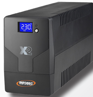
X2 LCD Touch 500/700/1000